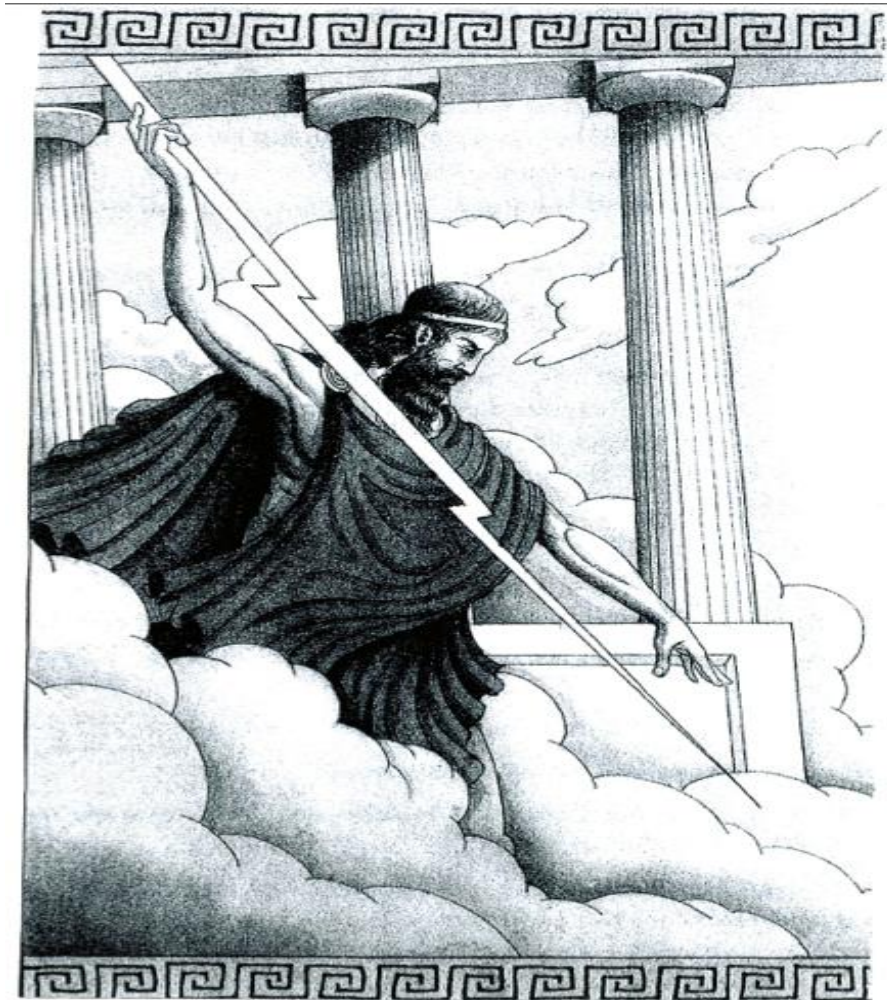
The Immortal Gods

Myths can best be described as traditional stories, folk tales, or legends that were passed down from one generation to the next. Writing did not exist thousands of years ago, when the world was new. The ancient Greeks did not have scientific