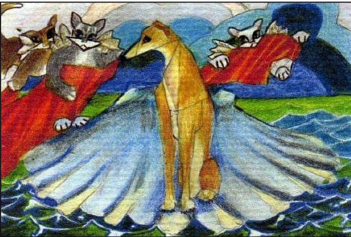
"Bryнна Rising From the Waves"

An artist who adopted two greyhounds painted a series of pictures of her beloved dogs which were published in a book. Below is a painting of "Bryнна," who looks a lot like the Roman goddess Venus in Sandro Botocelli's famous 15 th Century painting, "The Birth of Venus."